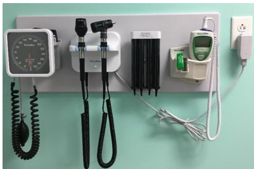
GS777 Wall Transformer