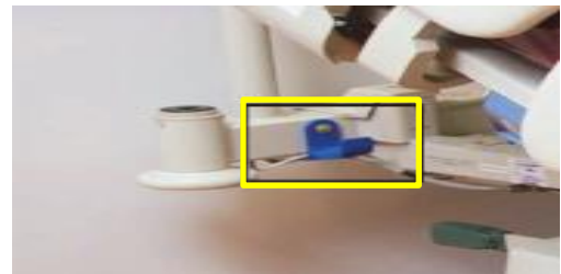
Fig. 1- Compella Cord Hooks.

There are two blue hooks on the inside of the head-end frame to stow the power cords for transport. Wrap the cords around the hooks so that they do not drag on the floor. (Fig 1.)