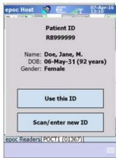
Figure 1: epoc Host2 "Use this ID" Button

The normal workflow is to insert a test card and during the calibration period, scan the patient ID and perform the PPID Lookup. This issue occurs if PPID is selected when the Host2 displays "Test Completed - Calculating" and the "Use This ID" button is pressed (shown in Figure 1). The "Use this ID" button should have been disabled but is prematurely enabled for the last 8 seconds of calculation. If the "Use this ID" button is pressed during this 8 second period, Host2 freezes causing results and the patient sample to be lost and sample re-collection may be potentially required.