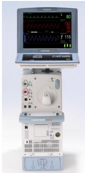
Figure 4: Cardiosave in Transport Configuration

An unexpected shutdown upon battery removal cannot occur for Cardiosave Rescue.