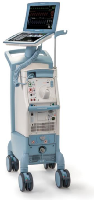
Figure 3: Cardiosave in Hybrid Configuration